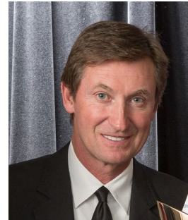
Wayne Gretzky Alternate Governor