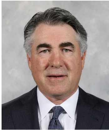
Dave Tippett Head Coach