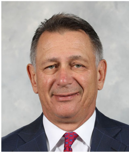
Ken Holland President of Hockey Operations and General Manager